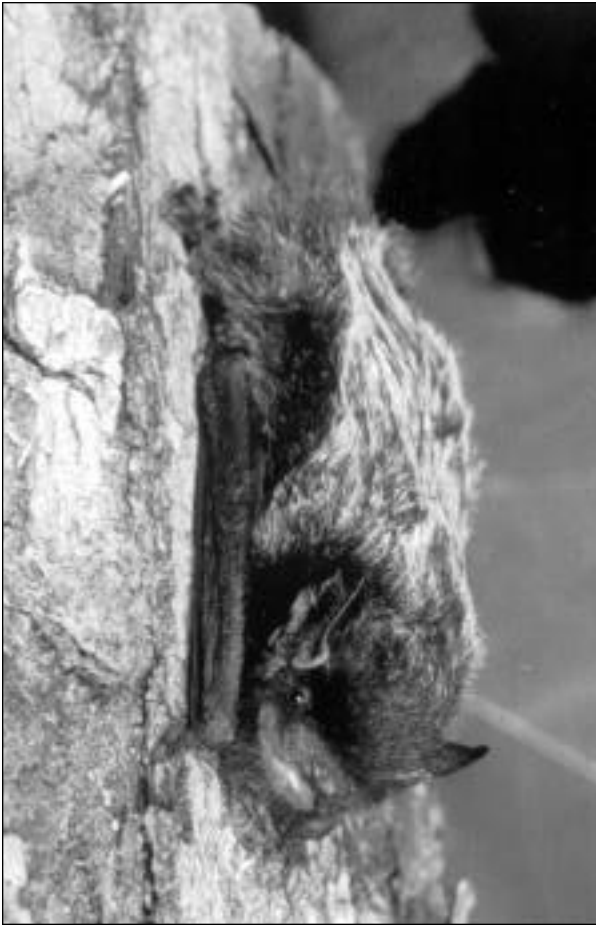
Figure 4: A silver-haired bat ( Lasiurus noctivagans ), which is an important vector for transmission of rabies virus to humans in the United States. The rabies bat virus variant in silver-haired bats is also present in eastern pipistrelle bats ( Pipistrellus subflavus ). Both of these species of bats are present in the United States and Canada.

cell types present in the dermis, including fibroblasts and epithelial cells, indicating that it has biological and biochemical properties associated with adaptation for initiating infection after superficial exposures. 38