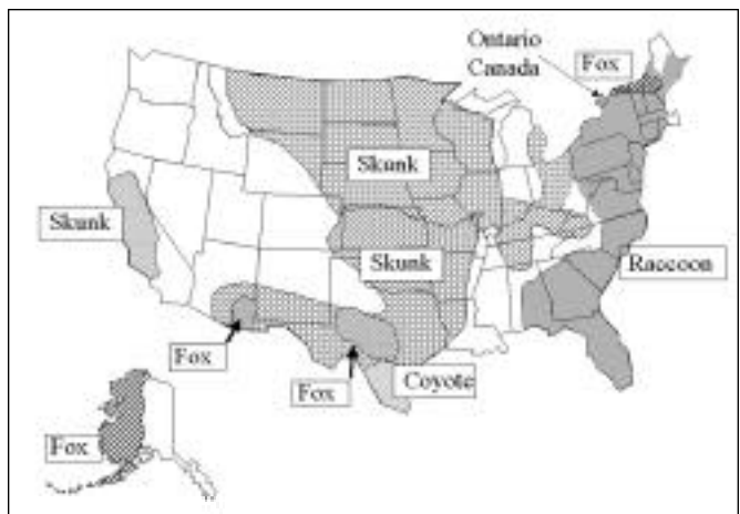
Figure 3: Geographic distribution of terrestrial vectors of rabies in the United States. From Centers for Disease Control and Prevention. 36